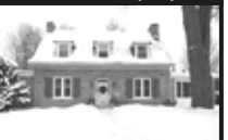
ISLAND PARK $1,100,000

549 PICCADILLY AV Prime Central Location. French Country Style Home. ~2830sqft Above Grade. Full Stone Exterior. 3 Bed + Den, 4 Bths. 9ft Ceilings, Hrdwd Flrs. Private Backyd w/ Covered Terrace.