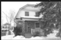
ISLAND PARK $499,000

42 GENEVA ST Family Friendly Street 3+1 Bedrooms, 2 Bths. ~1,351 sqft Above Grade. Hardwood Throughout. Bright Living Spaces. Main Fir Den, Fireplace. Furnace '09 Windows '05.