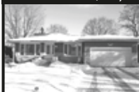
MCKELLAR HTS $499,000

967 KILLEEN AV Fabulous Oversize Gardens. ~1868sqft Above Grade. 3+1 Bedrooms, 3 Full Baths. Master Incl. Full Ensuite. Well Remodeled Kitchen. Brilliant Large Family Rm. Spacious In-Law Suite.