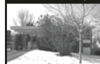
COPELAND PK $429,900

1190 BONNIE AV Unbelievable Space. ~1760sqft Above Grade. Plus Walk-out FamRm. 4 Big Bedrms, 2 Bths. Huge Eat-In Kitchen. Hardwd, 2 Fireplaces & Floor-to Ceiling Windows.