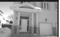
GLABAR PARK $389,000

835 WOODROFFE AV Fabulous New Semi. 2000 sqft including Finished Basement. 3 Bedrooms & 4 Bathrooms. Great Room Style Living. Hi-Quality Finishings. 9' Ceilings, Oak Hardwood + Cabinets, Pot Lights.